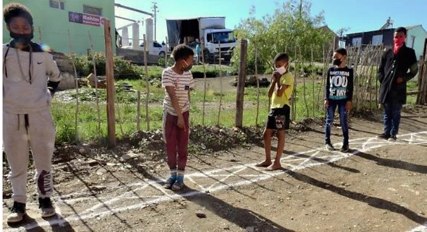
Socially distanced youngsters waiting to enter our Centre