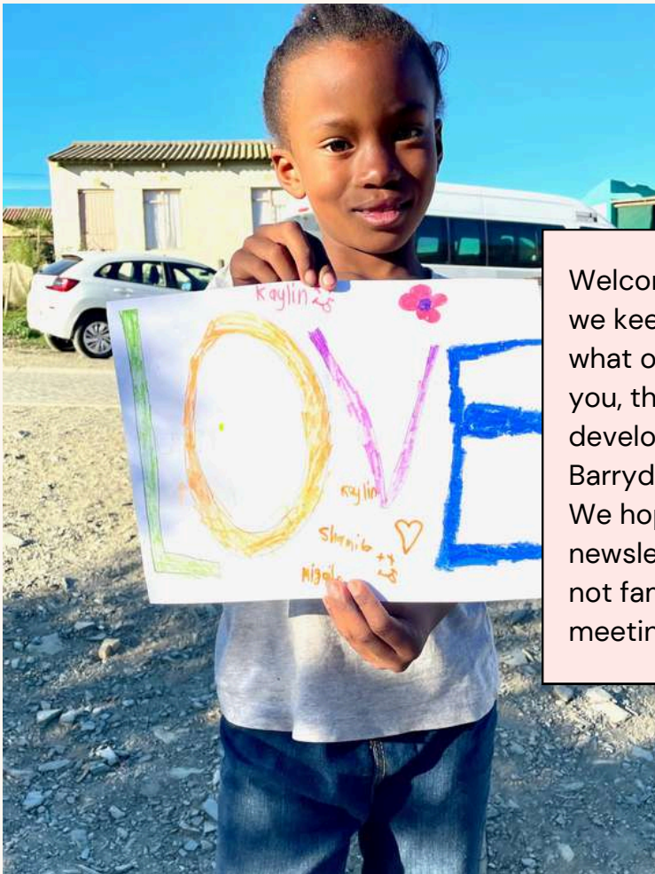
AWESOME! YOUNG GIRL POSTING WITH HER POSTER

Welcome to our Monthly Newsletter, where we keep you informed on what we do and what our plans are. It is our way of keeping you, the Net Vir Pret Family, up to date on our development with the youngsters of the Barrydale community and surrounding farms. We hope you enjoy reading through our newsletter and please do share with friends not familiar with Net Vir Pret. We are open to meeting new people.